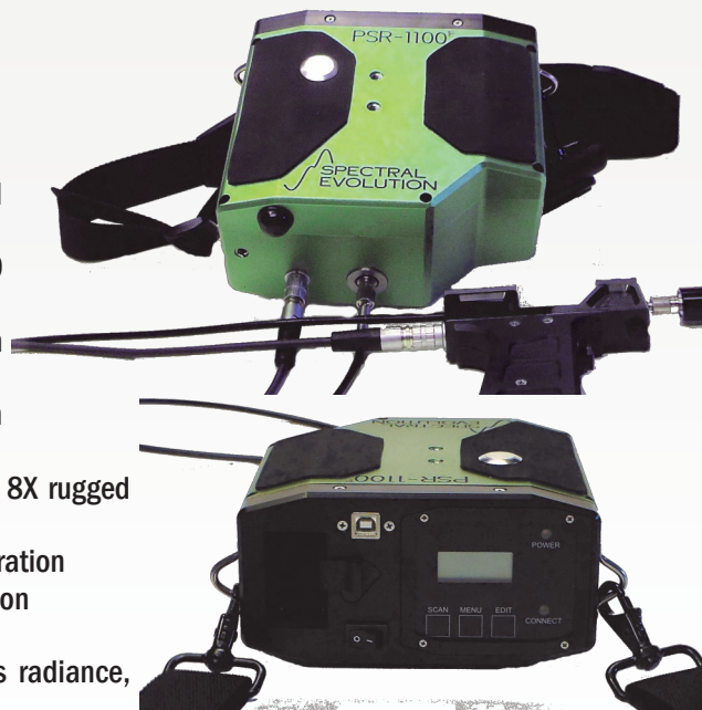
PSR-1100 f has a built-in LCD screen and keypad and can store up-to 2500 scans.